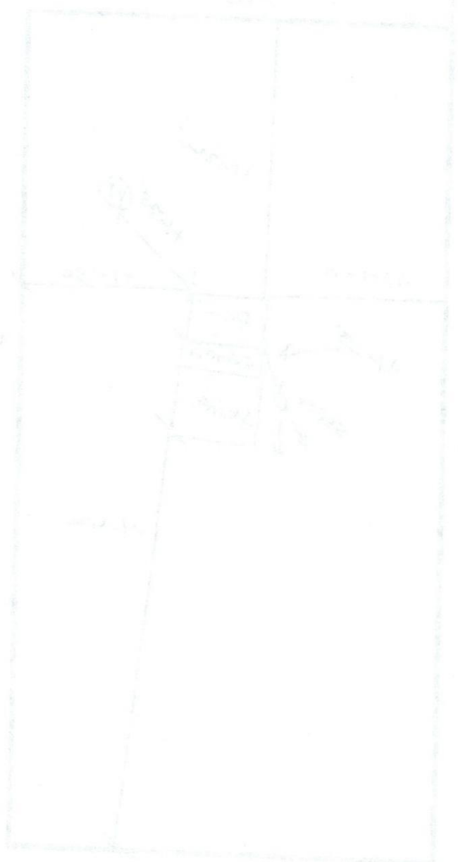
Hand-drawn diagram of a rectangular plot divided into several smaller rectangular sections.