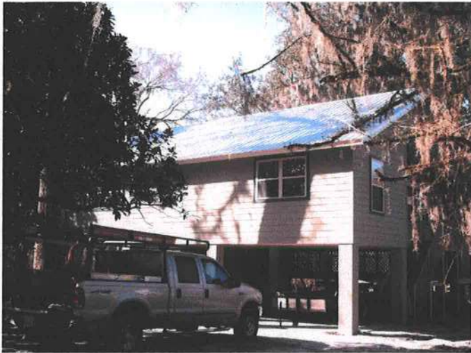
FRONT VIEW OF HOUSE