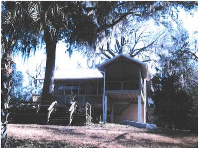
REAR VIEW OF HOUSE