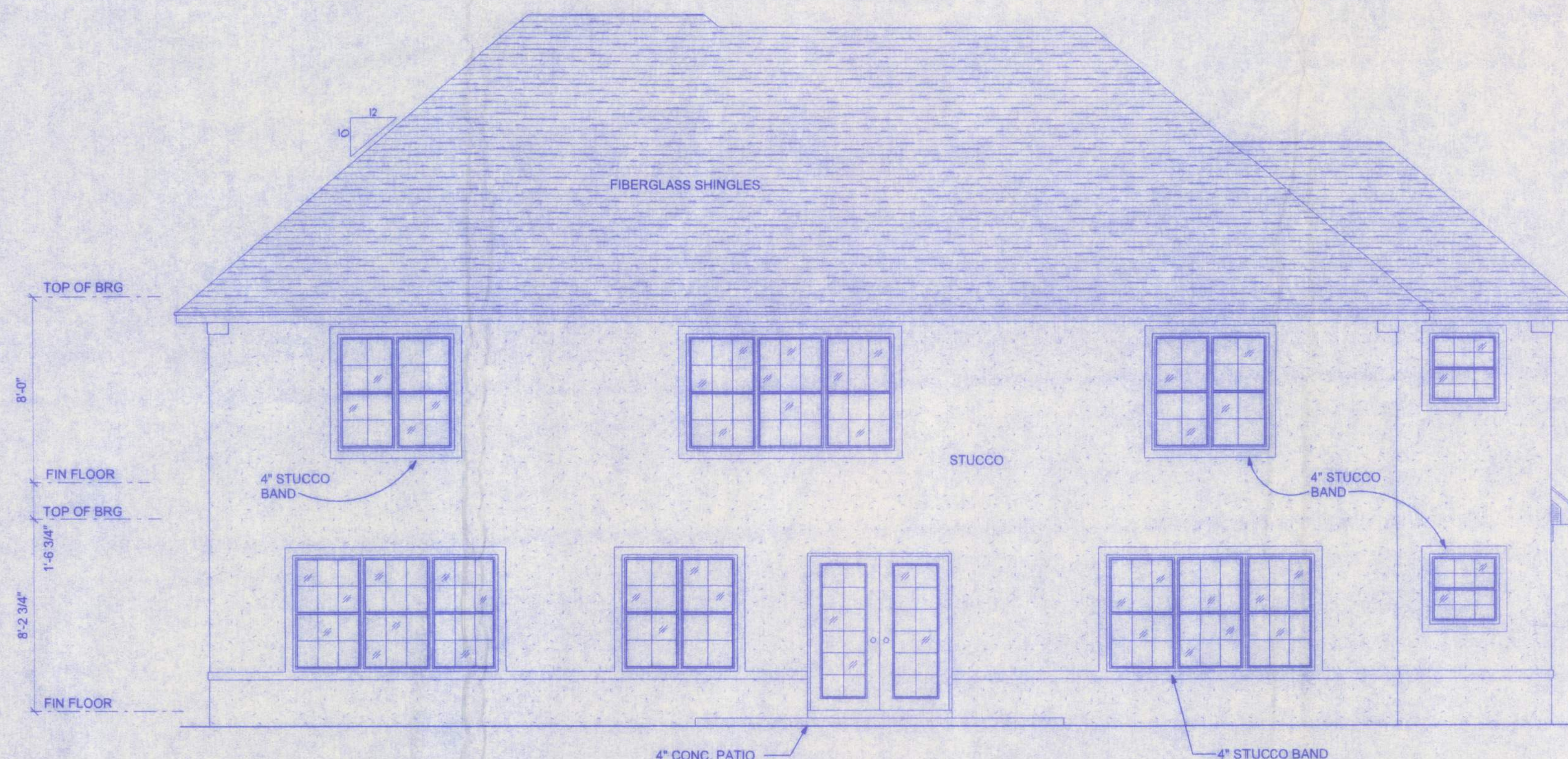
REAR ELEVATION SCALE: 1/4" = 1'-0"

PLEASE DO NOT MAKE ANY STRUCTURAL CHANGES TO THESE PLANS WITHOUT CONSULTING WITH THE ARCHITECT/ENGINEER. THE OWNER SHALL ASSUME ANY AND ALL LIABILITY FOR STRUCTURAL DAMAGE RESULTING FROM CHANGES MADE TO THE PLANS OR BY SUBSTITUTION OF MATERIALS DIFFERENT FROM SPECIFICATIONS ON THE PLANS.