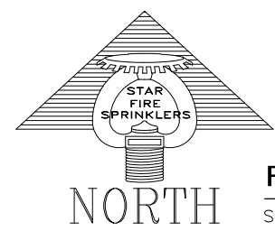
SCALE: NOT TO SCALE