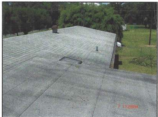
Low sloped roof