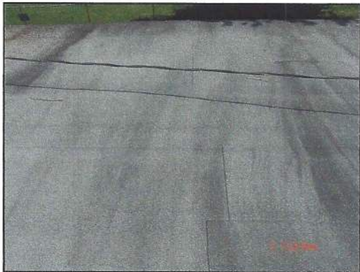
Low sloped roof