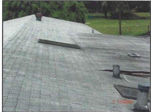
Rear view of roof