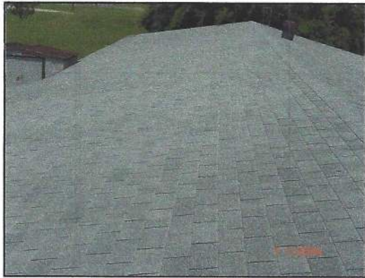
Front view of roof