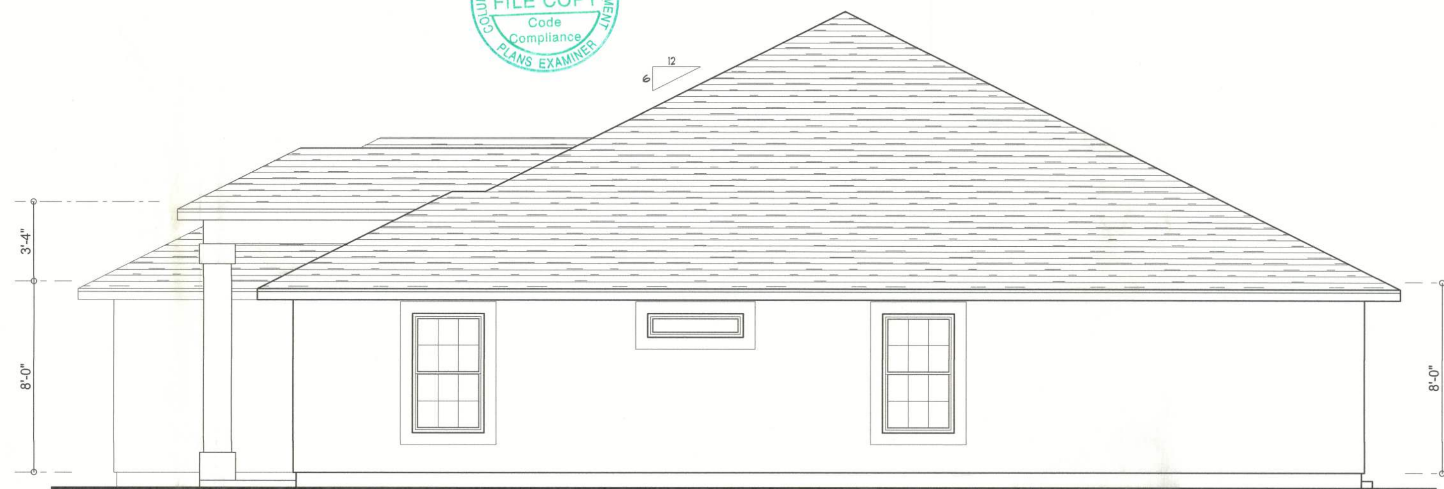
RIGHT ELEVATION SCALE: 1/4" = 1'-0"