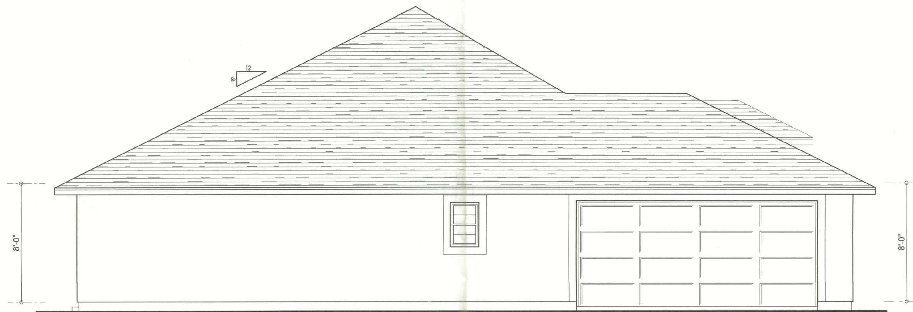
LEFT ELEVATION SCALE: 1/4" = 1'-0"