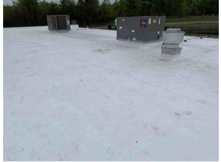
Group: 1.10 - Category: Overview