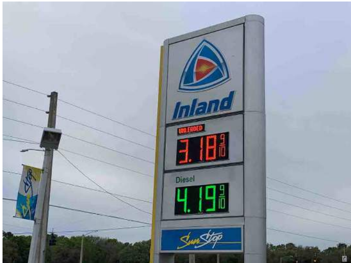
Group: 1.3 - Category: Address Verification

Comments: Overhead view of property, arrow indicates north