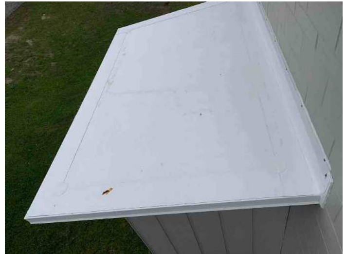
Group: 1.12 - Category: Overview Comments: Small roof area on the back