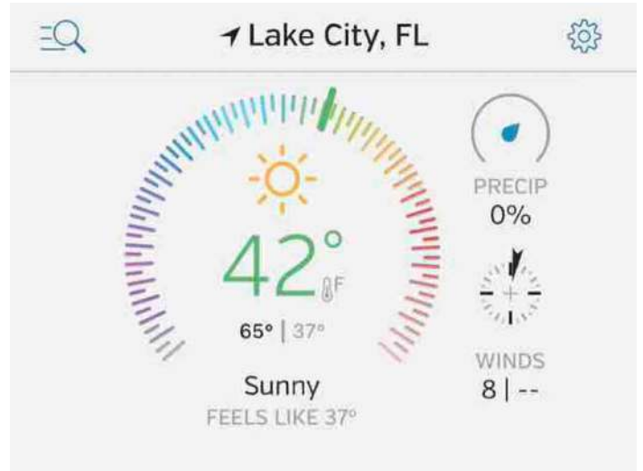
Group: 1.4 - Category: Weather