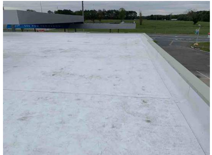
Group: 1.8 - Category: Overview