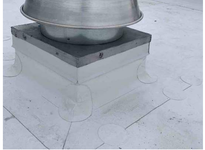
Group: 1.22 - Category: Typical Detail

Comments: Vent curb detail with counter flashing termination caulk sealed