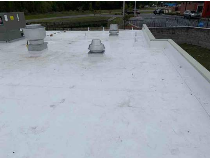
Group: 1.11 - Category: Overview