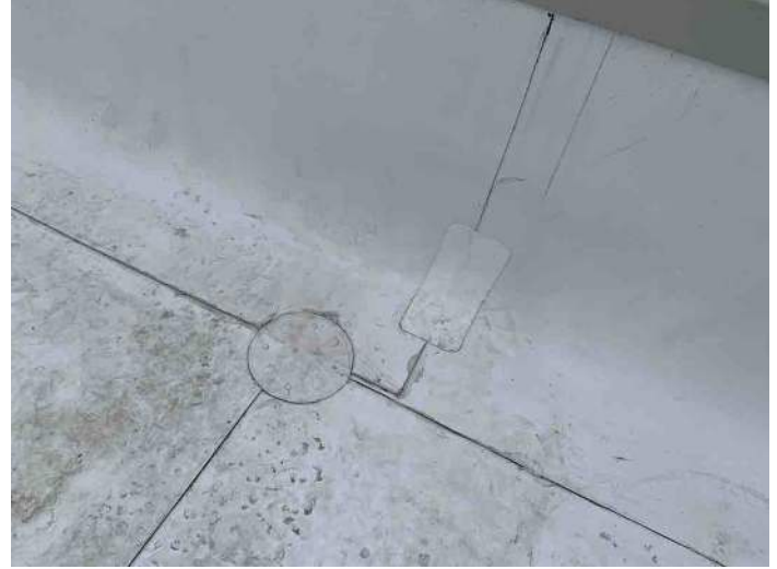
Group: 1.18 - Category: Typical Detail Comments: T patches and blow out patches installed where needed