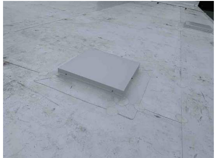
Group: 1.24 - Category: Typical Detail

Comments: Vertical termination with TPO clad metal