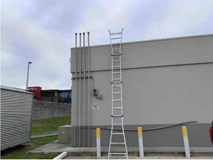
Group: 1.5 - Category: Roof Access

Contractor O'NEAL ROOFING CO Property Sun Stop #341 4046 SW St. Rd. 47 Lake city, FL 32024