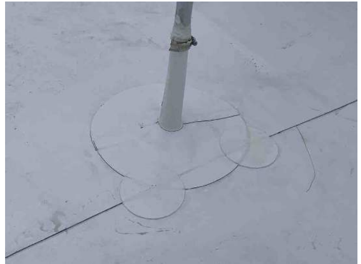
Group: 1.20 - Category: Typical Detail Comments: JM prefabricated pipe wrap detail clamped and caulked