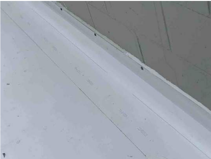
Group: 1.27 - Category: Typical Detail Comments: Counter flashing detail on back roof area