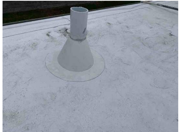
Group: 1.16 - Category: Typical Detail Comments: Pipe boot detail clamped and caulked