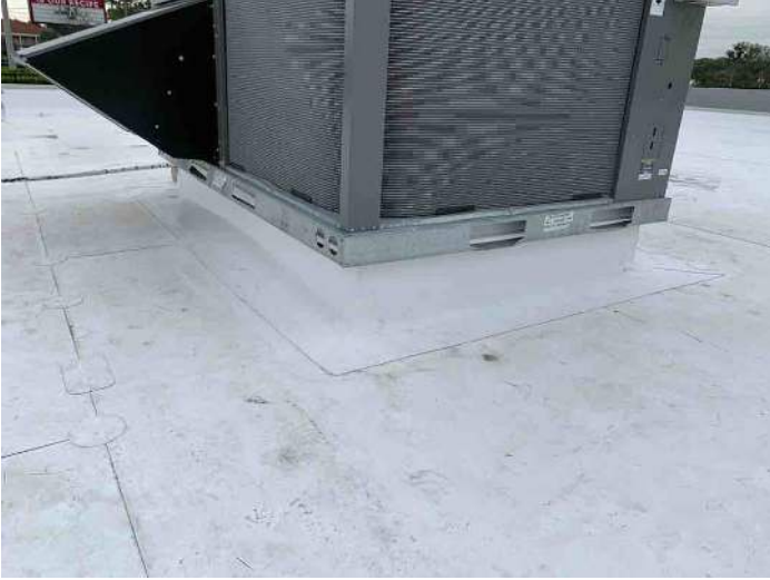
Group: 1.25 - Category: Typical Detail Comments: RTU curb detail with skirt metal termination

Contractor O'NEAL ROOFING CO Property Sun Stop #341 4046 SW St. Rd. 47 Lake city, FL 32024