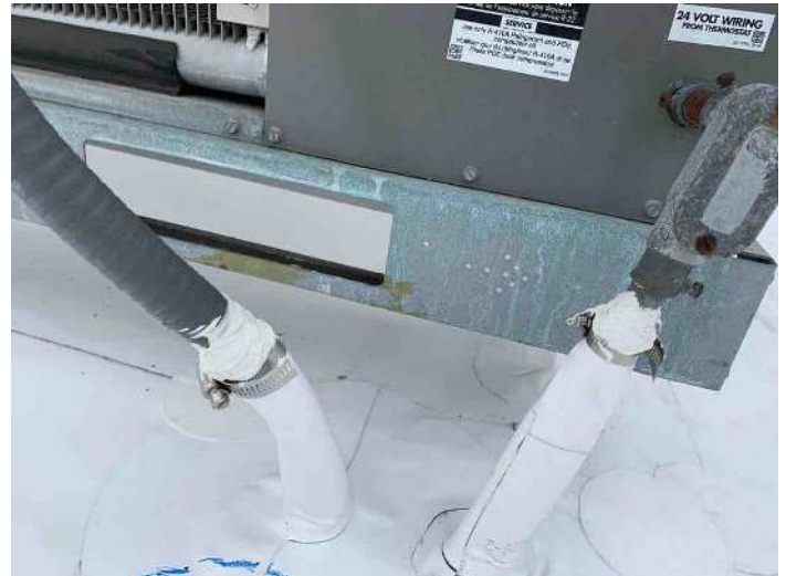
Group: 1.28 - Category: Typical Detail Comments: JM prefabricated pipe wrap detail on electrical conduits clamped and caulked