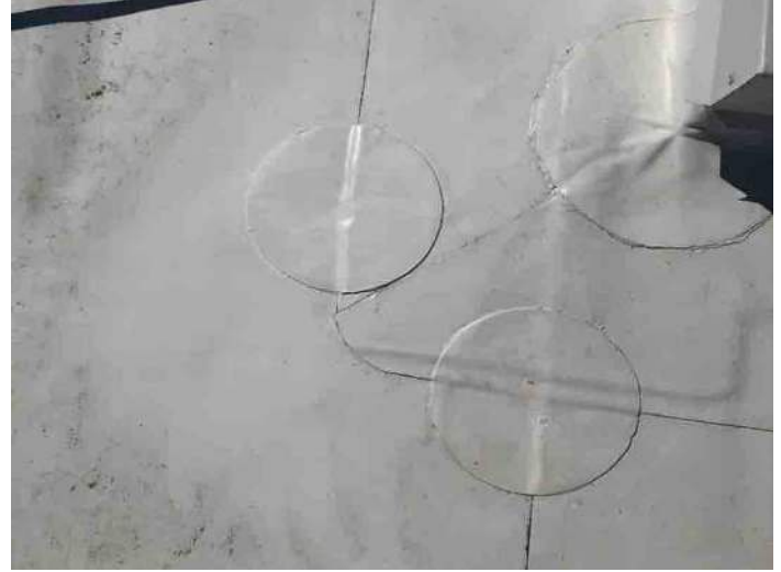
Group: 1.14 - Category: Typical Detail Comments: Repairs made to flashing details