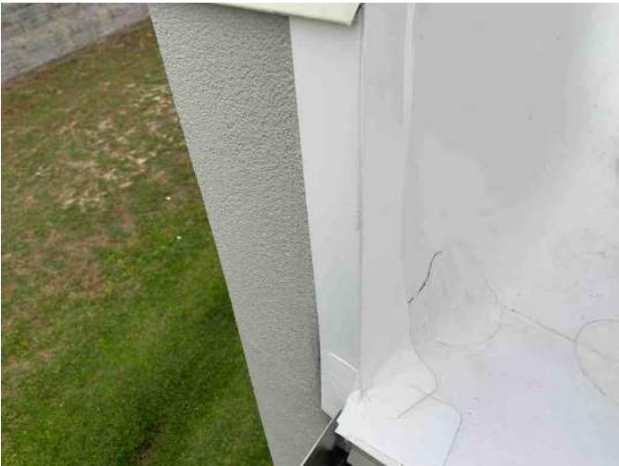
Group: 1.23 - Category: Typical Detail

Comments: Vent curb detail with skirt metal termination