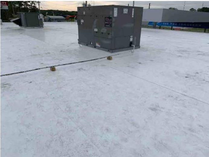
Group: 1.7 - Category: Overview