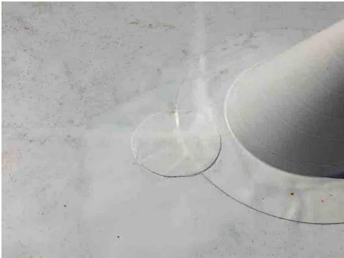
Group: 1.15 - Category: Typical Detail Comments: Repairs made to flashing details