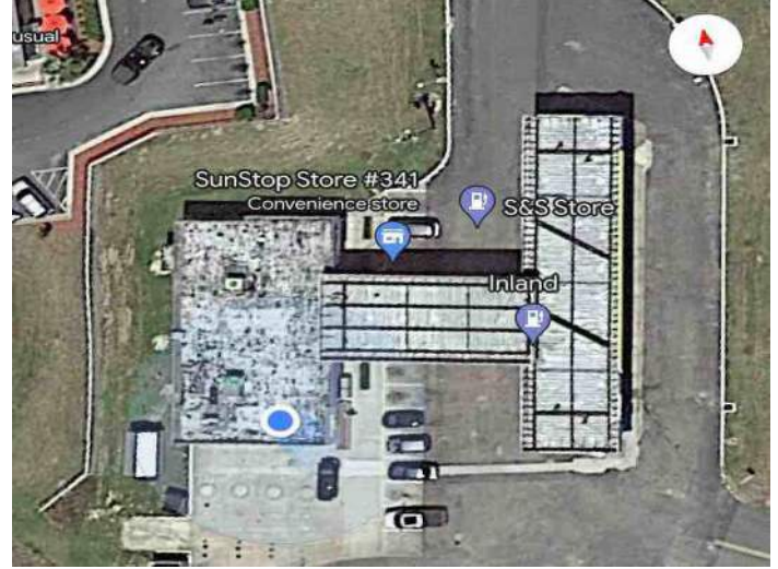
Group: 1.2 - Category: Building View

Contractor O'NEAL ROOFING CO Property Sun Stop #341 4046 SW St. Rd. 47 Lake city, FL 32024