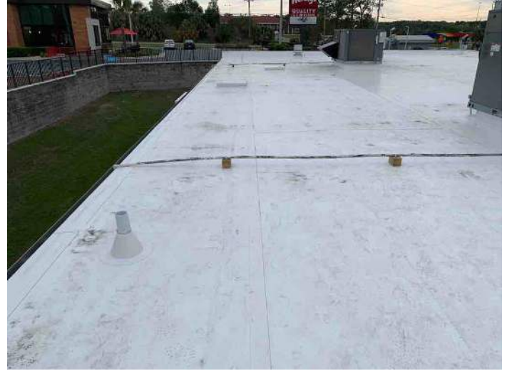
Group: 1.6 - Category: Overview