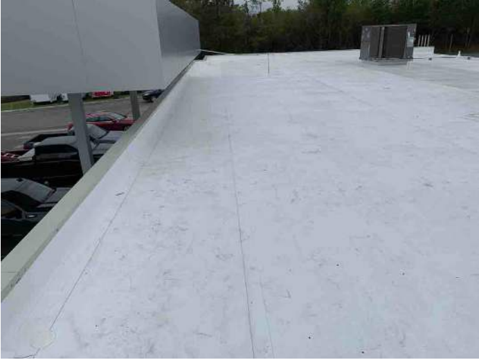
Group: 1.9 - Category: Overview

Contractor O'NEAL ROOFING CO Property Sun Stop #341 4046 SW St. Rd. 47 Lake city, FL 32024