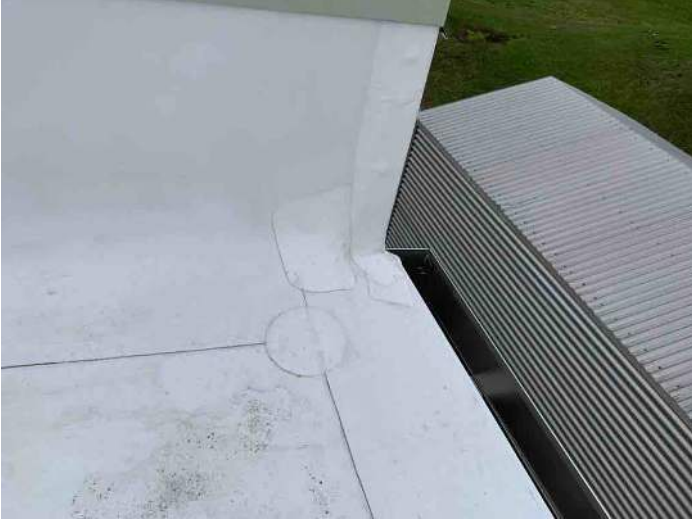
Group: 1.17 - Category: Typical Detail Comments: Vertical termination detail with TPO clad metal

Contractor O'NEAL ROOFING CO Property Sun Stop #341 4046 SW St. Rd. 47 Lake city, FL 32024