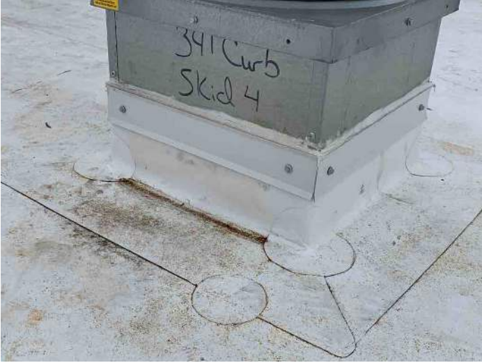
Group: 1.21 - Category: Typical Detail

Contractor O'NEAL ROOFING CO Property Sun Stop #341 4046 SW St. Rd. 47 Lake city, FL 32024