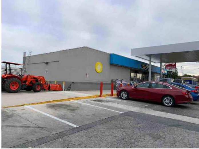
Group: 1.1 - Category: Building View

Tracking Numb... 8093072 Guarantee Nu... Not yet issued Inspection Date: Wednesday, March 15, 2023 Inspected By: James Huff