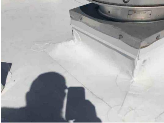
Group: 1.13 - Category: Typical Detail Comments: Repairs made to flashing details

Contractor O'NEAL ROOFING CO Property Sun Stop #341 4046 SW St. Rd. 47 Lake city, FL 32024