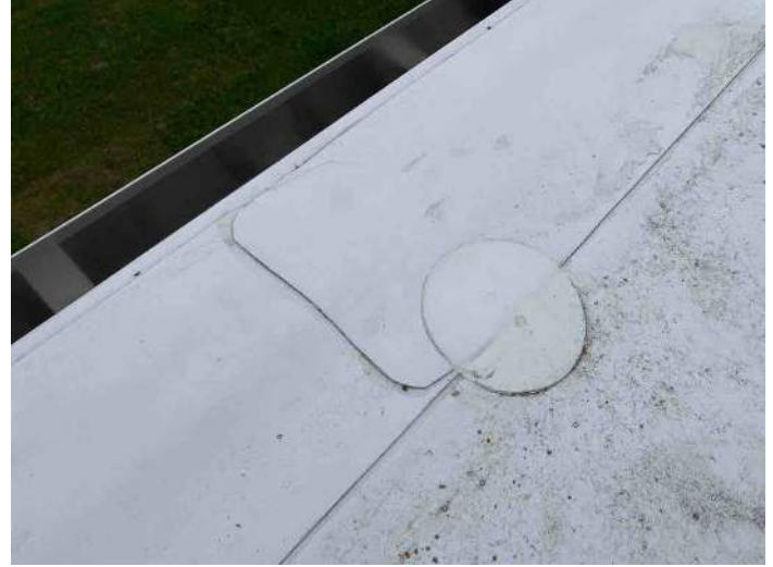
Group: 1.26 - Category: Typical Detail Comments: T patches and blow out patches installed where required