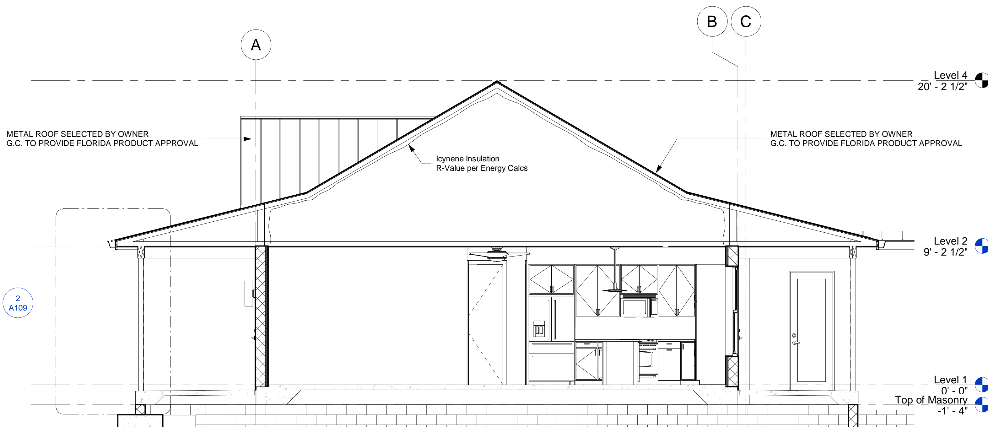
1 Building Section 1 1/4" = 1'-0"