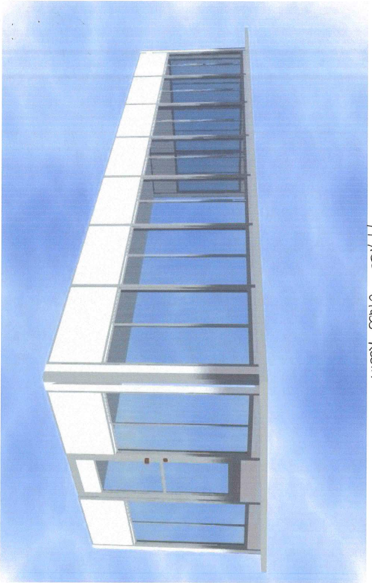
14' x 30' Glass Room