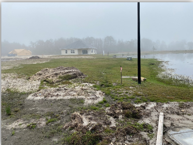
Photo 2. Subject property looking east from entrance road.