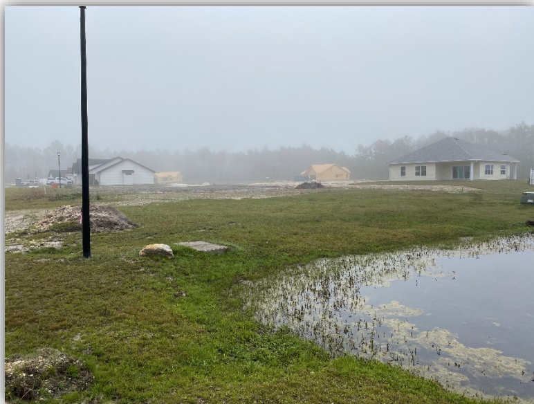
Photo 1. Subject property looking northeast from entrance road.