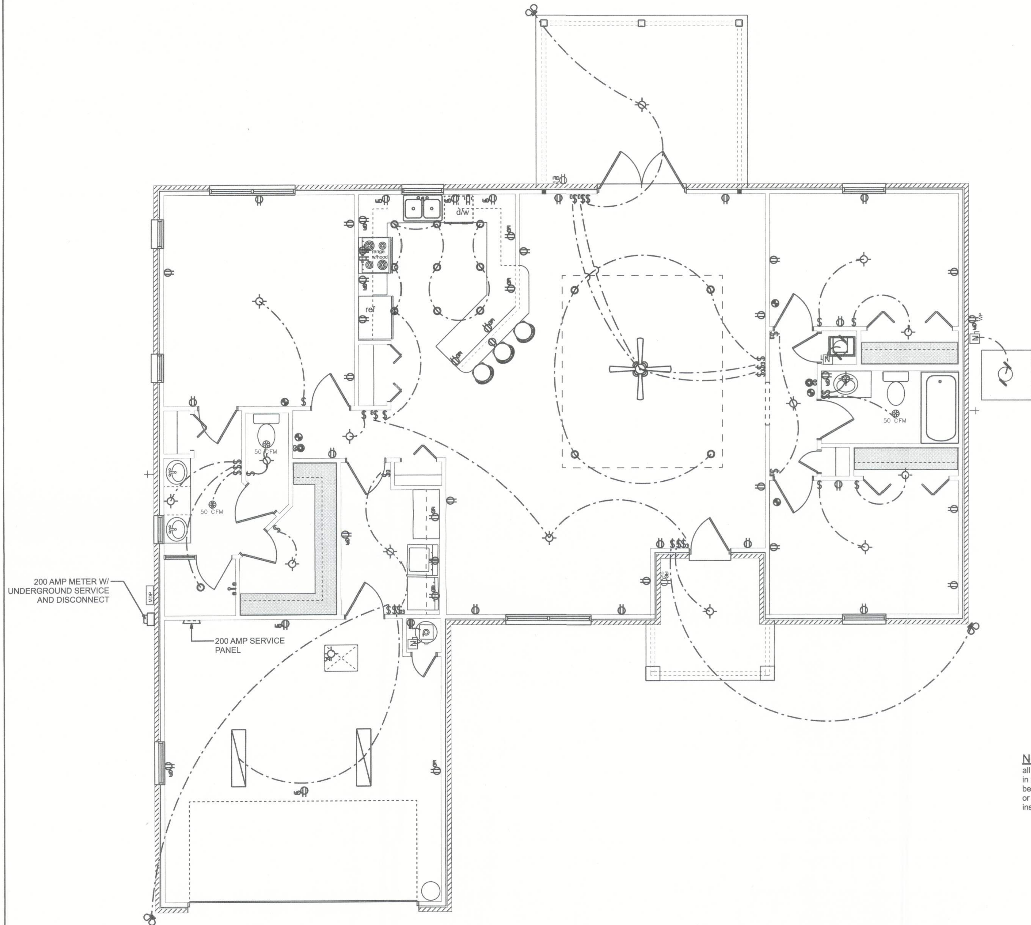
ELECTRICAL PLAN SCALE 1/4"=1'-0"