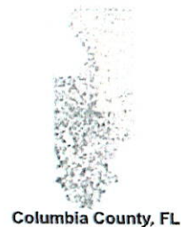
Columbia County, FL

This information, was derived from data which was compiled by the Columbia County Property Appraiser Office solely for the governmental purpose of property assessment. This information should not be relied upon by anyone as a determination of the ownership of property or market value. No warranties, expressed or implied, are provided for the accuracy of the data herein, it's use, or it's interpretation. Although it is periodically updated, this information may not reflect the data currently on file in the Property Appraiser's office.