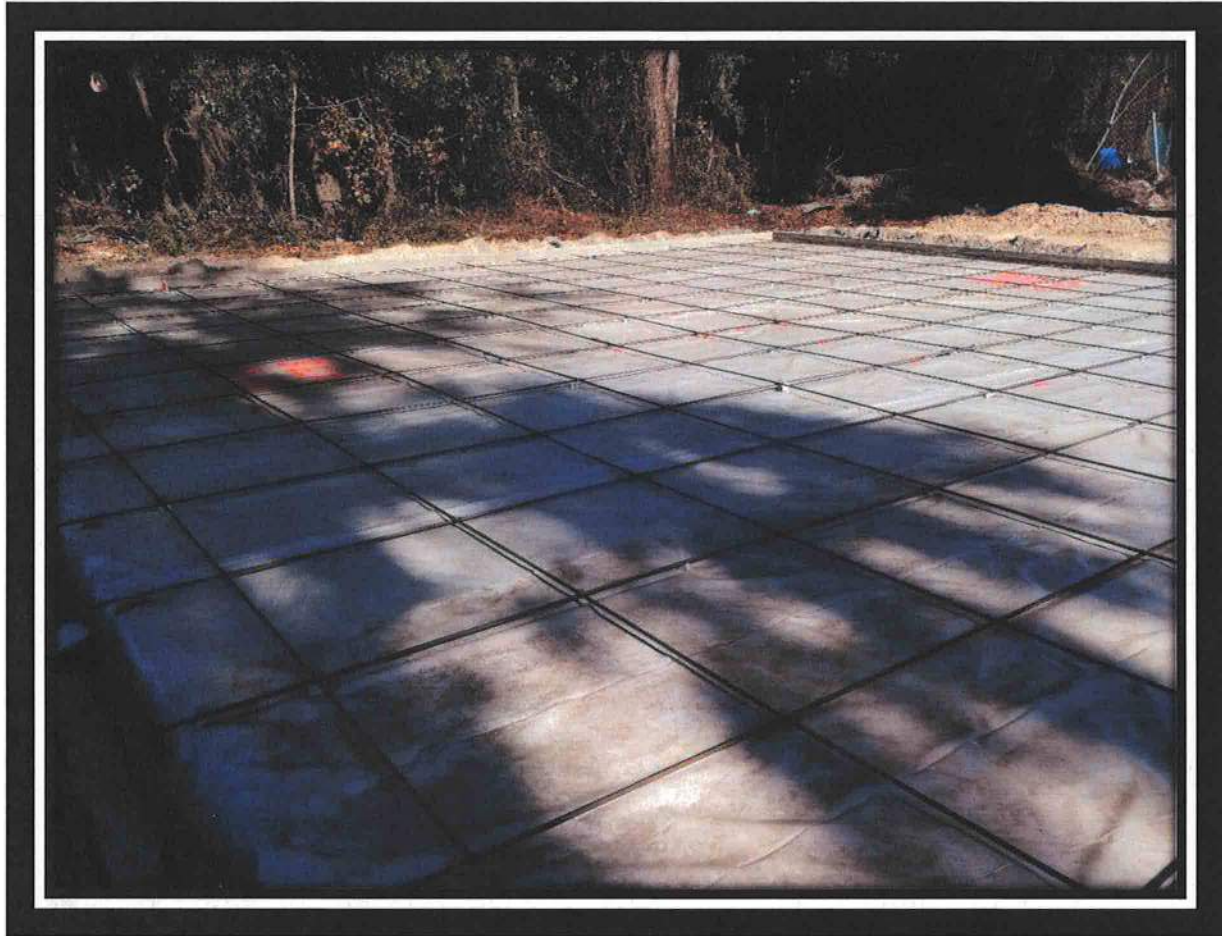
Overall view of the slab showing vapor barrier and reinforcement.