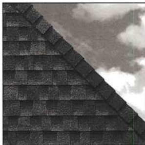
PRESTIQUE® HIGH DEFINITION®

ROOFING PRODUCTS SPECIFICATIONS – TUSCALOOSA, AL