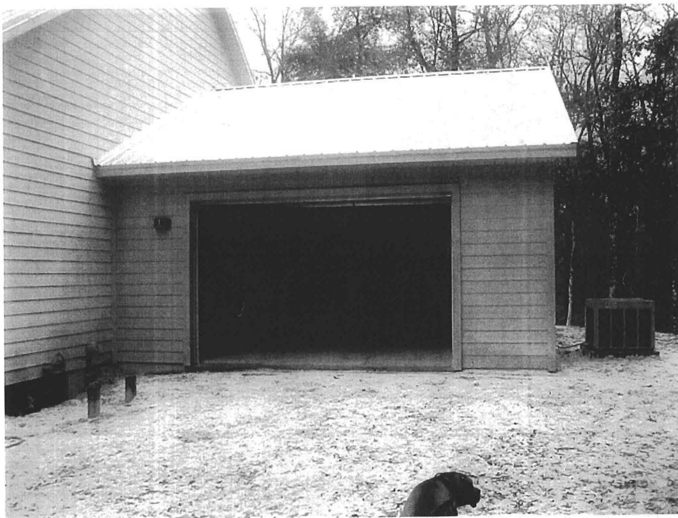
FRONT AND RIGHT SIDE VIEW SHOWING GARAGE FLOOR AND A/C. 12/24/2014

If using the Elevation Certificate to obtain NFIP flood insurance, affix at least 2 building photographs below according to the instructions for Item A6. Identify all photographs with date taken; "Front View" and "Rear View"; and, if required, "Right Side View" and "Left Side View." When applicable, photographs must show the foundation with representative examples of the flood openings or vents, as indicated in Section A8. If submitting more photographs than will fit on this page, use the Continuation Page.