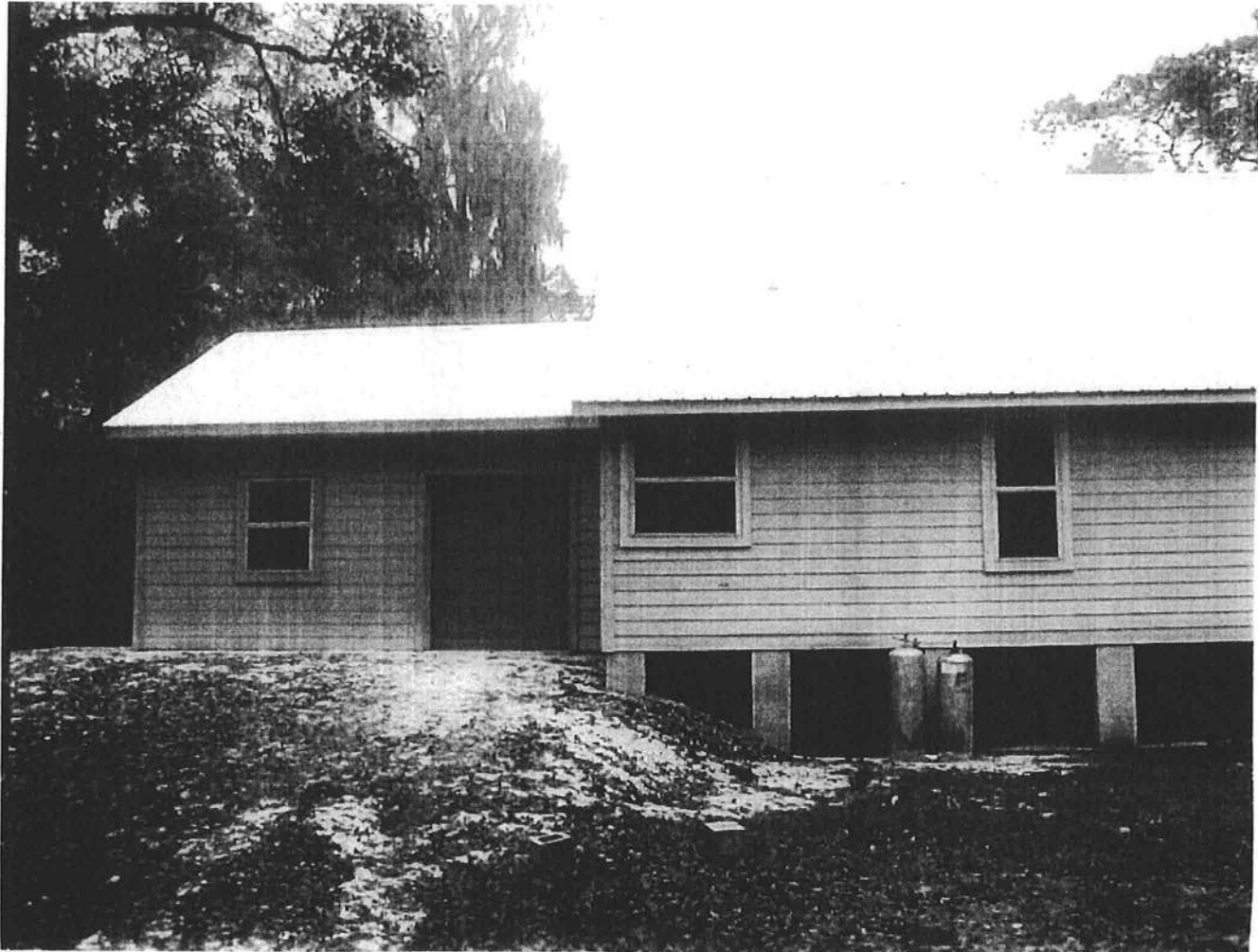
REAR VIEW SHOWING FILL AND ADJACENT DWELLING THAT THE GARAGE IS ATTACHED TO. DATE 12/24/2014.

If submitting more photographs than will fit on the preceding page, affix the additional photographs below. Identify all photographs with: date taken; "Front View" and "Rear View"; and, if required, "Right Side View" and "Left Side View." When applicable, photographs must show the foundation with representative examples of the flood openings or vents, as indicated in Section A8.