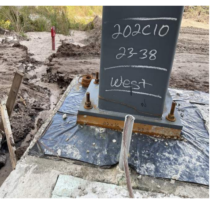
Loose bolts at column base plates

I certify that the above inspection report is true and accurate.