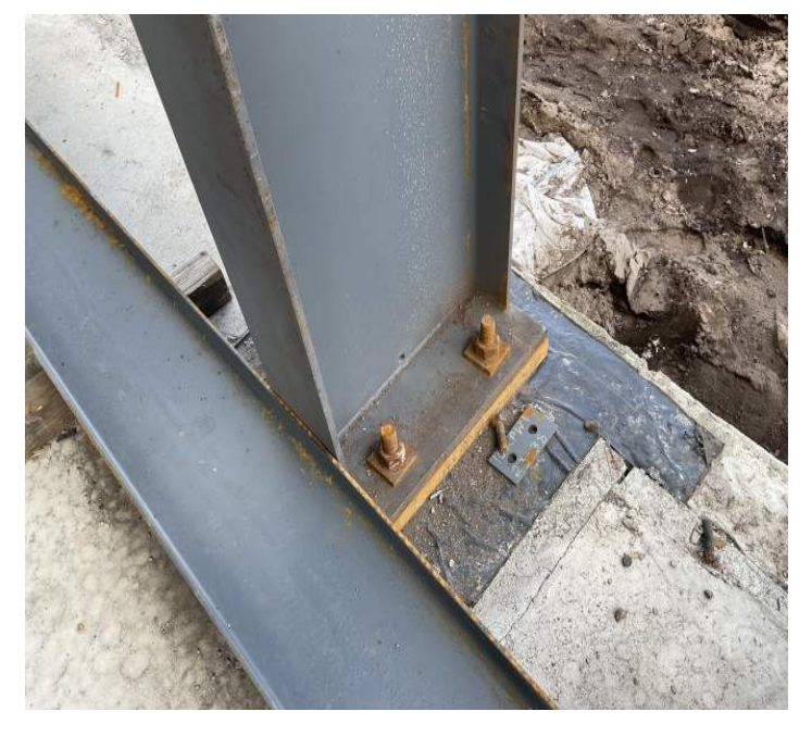
Plate washers not welded along Line 23