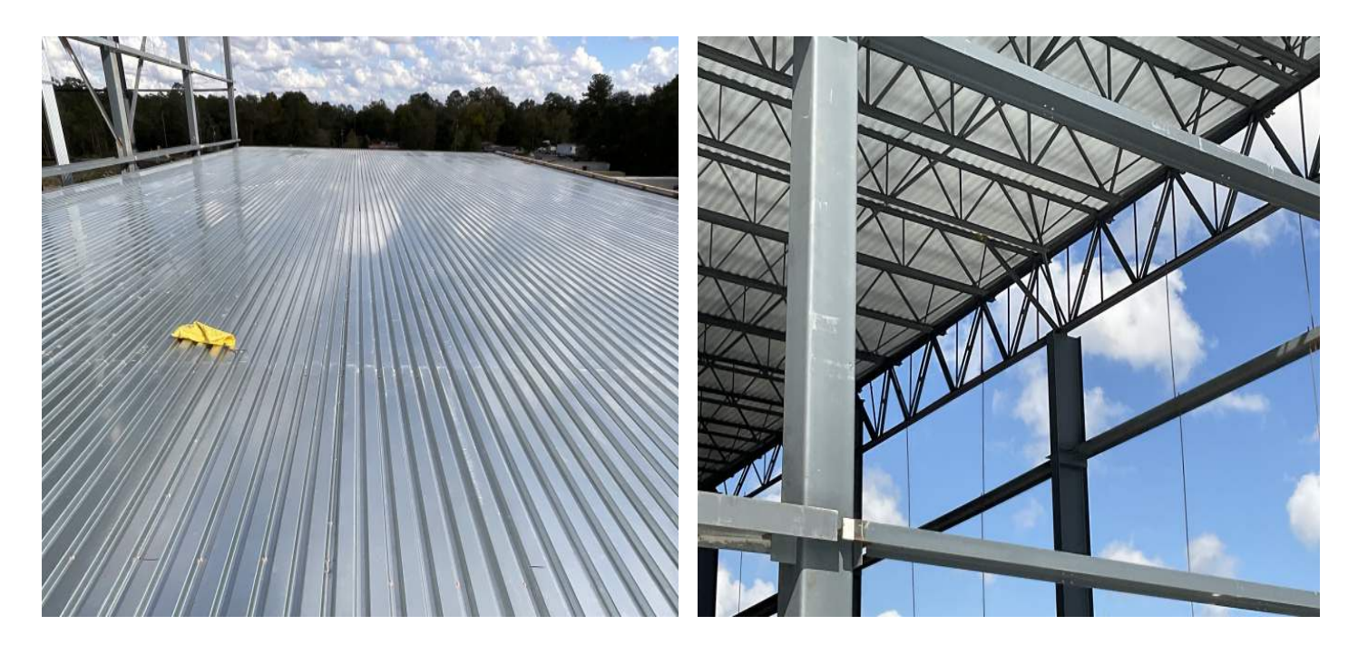
Low roof completed