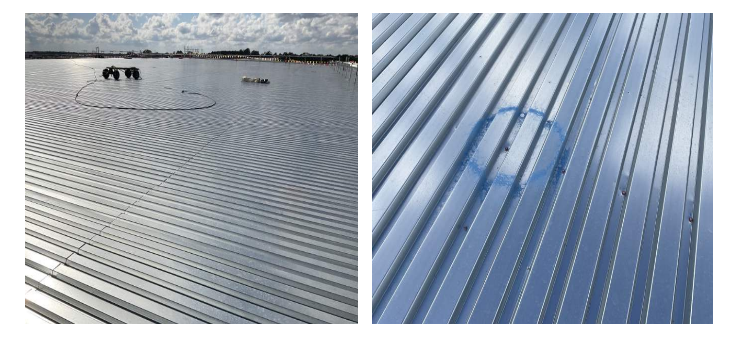
Missing pins and side lap fasteners completed at the roof level