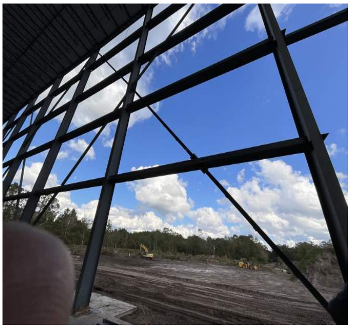
TC bolt splines not severed at braced frame connections