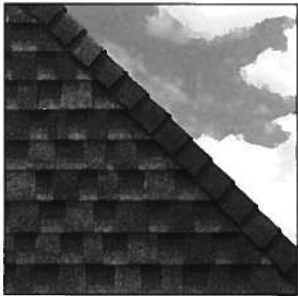
PRESTIQUE® HIGH DEFINITION®

ROOFING PRODUCTS SPECIFICATIONS – TUSCALOOSA, AL