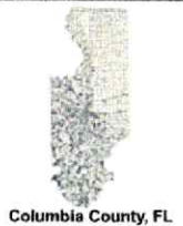
Columbia County, FL

This information, was derived from data which was compiled by the Columbia County Property Appraiser Office solely for the governmental purpose of property assessment. This information should not be relied upon by anyone as a determination of the ownership of property or market value. No warranties, expressed or implied, are provided for the accuracy of the data herein, it's use, or it's interpretation. Although it is periodically updated, this information may not reflect the data currently on file in the Property Appraiser's office.