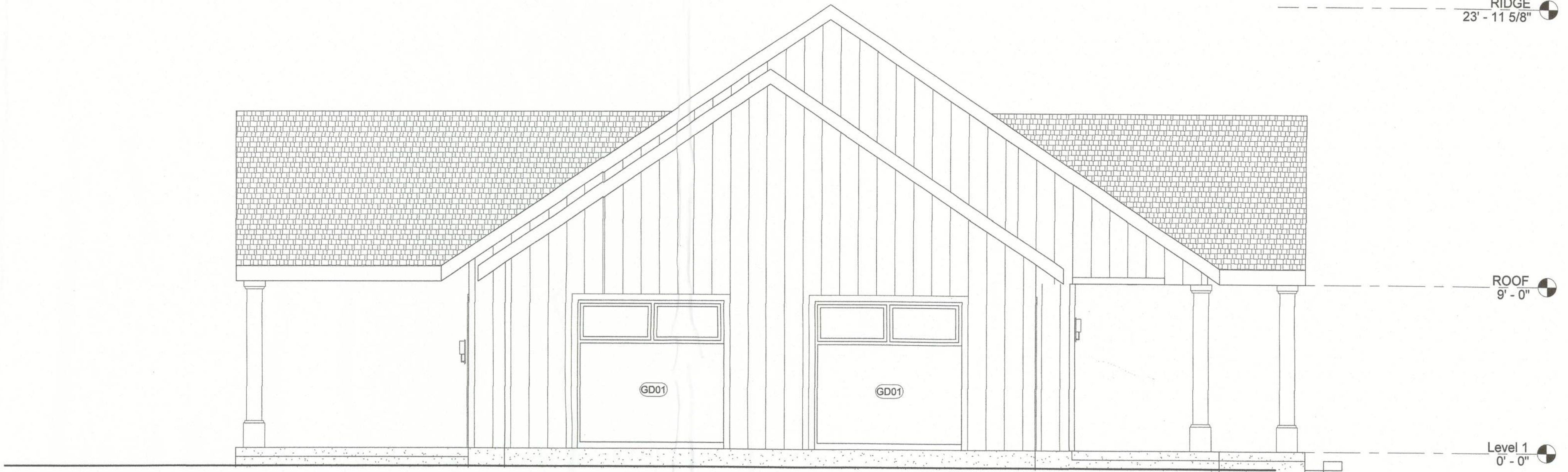
2 WEST ELEVATION 1/4" = 1'-0"