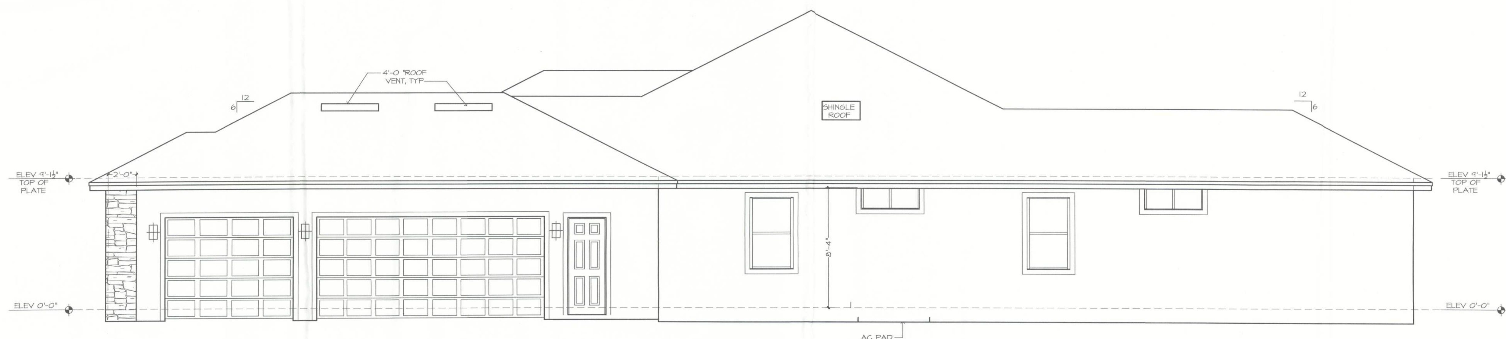
GARAGE SIDE ELEVATION