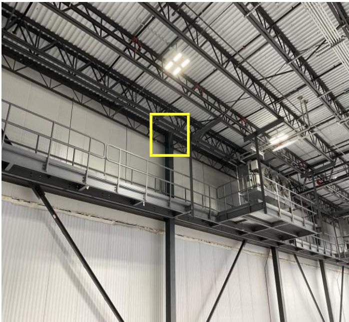
Girder bottom chords welded where required

I certify that the above inspection report is true and accurate.