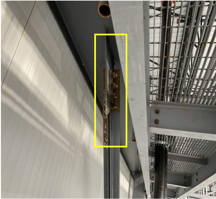
TC Bolts behind cat walk at braced frames along Line H.8 not completed