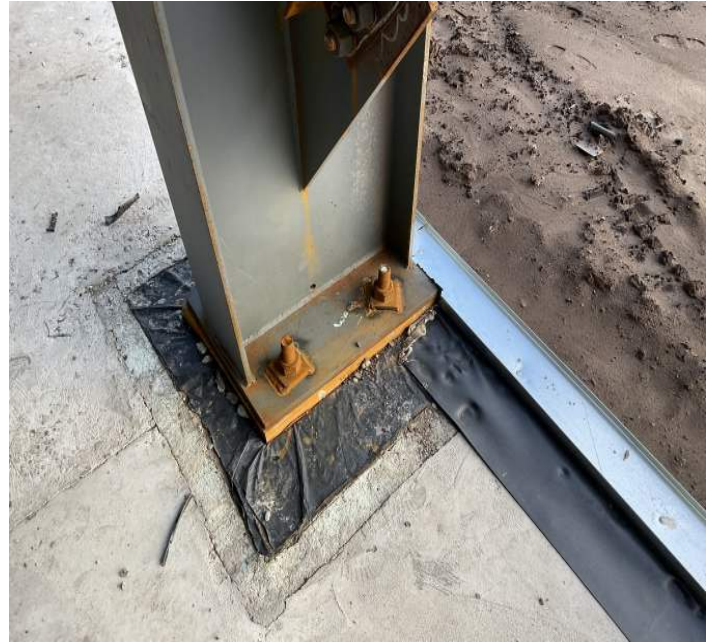
Missing plate washer weld completed along Line 23