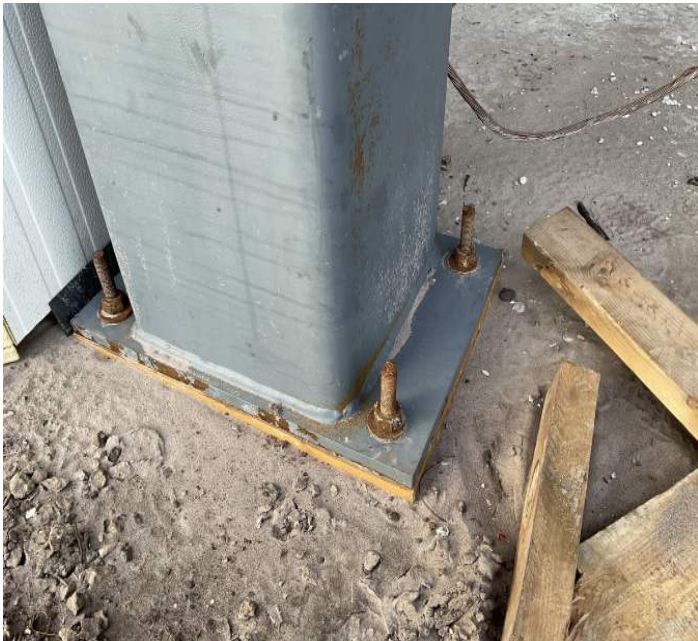
Loose washers in several locations at column base plates