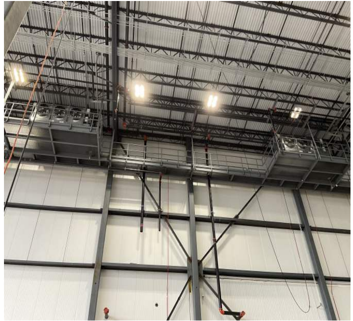
Several missing welds along South cat walk