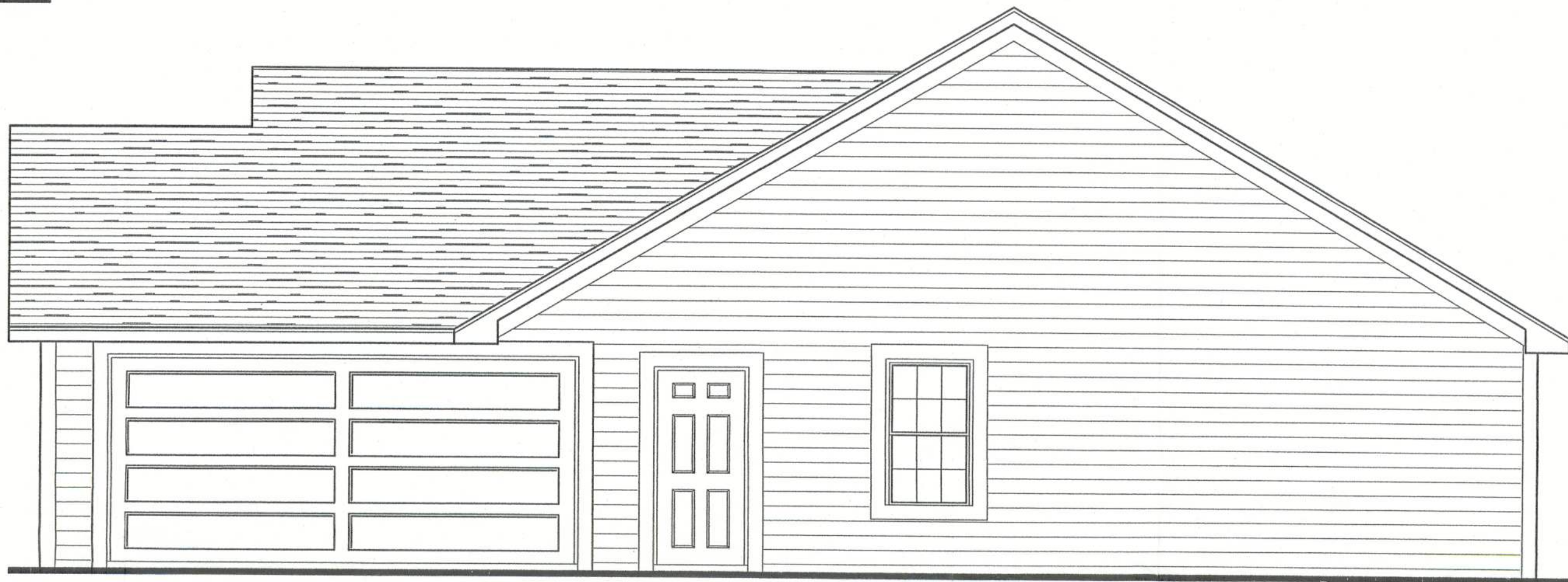
RIGHT ELEVATION SCALE: 1/4" = 1'-0"