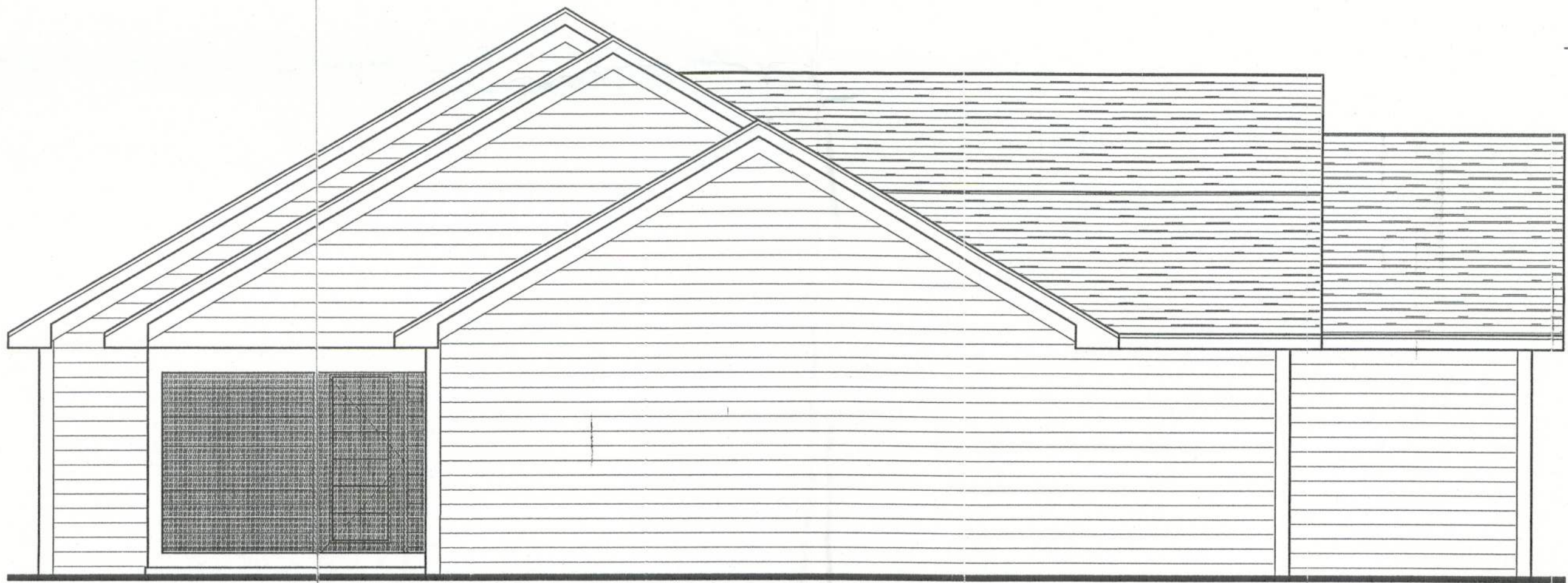
LEFT ELEVATION SCALE: 1/4" = 1'-0"