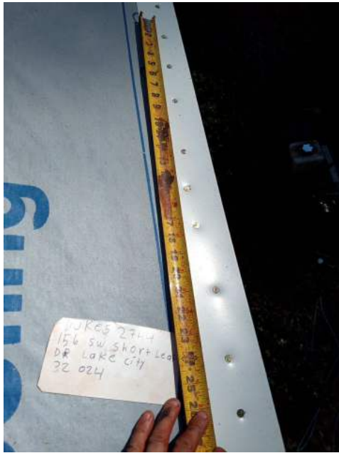
Dukes 2744 156 SW Short Leaf Dr • Lake City, FL 32024