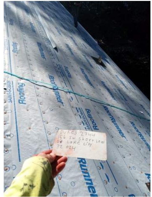
Dukes 2744 156 SW Short Leaf Dr • Lake City, FL 32024