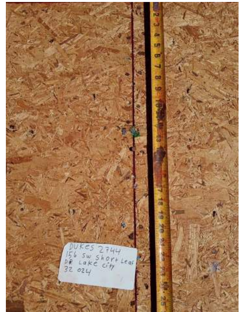
Dukes 2744 156 SW Short Leaf Dr • Lake City, FL 32024