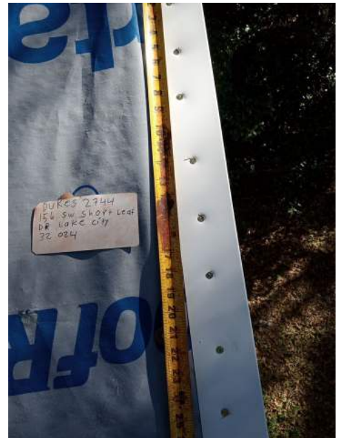
Dukes 2744 156 SW Short Leaf Dr • Lake City, FL 32024