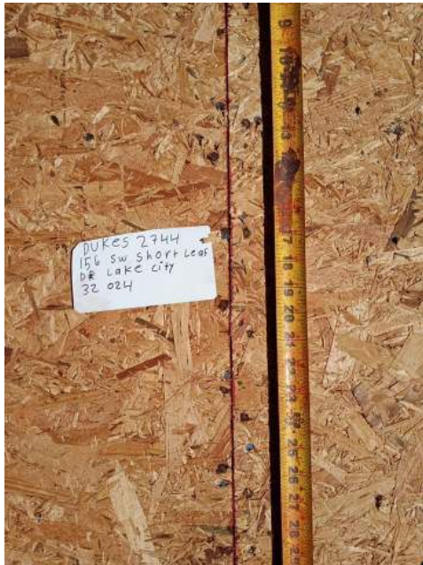
Dukes 2744 156 SW Short Leaf Dr • Lake City, FL 32024