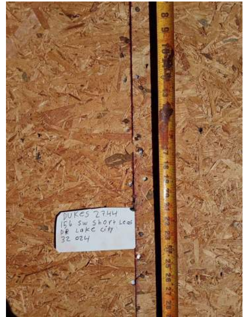
Dukes 2744 156 SW Short Leaf Dr • Lake City, FL 32024