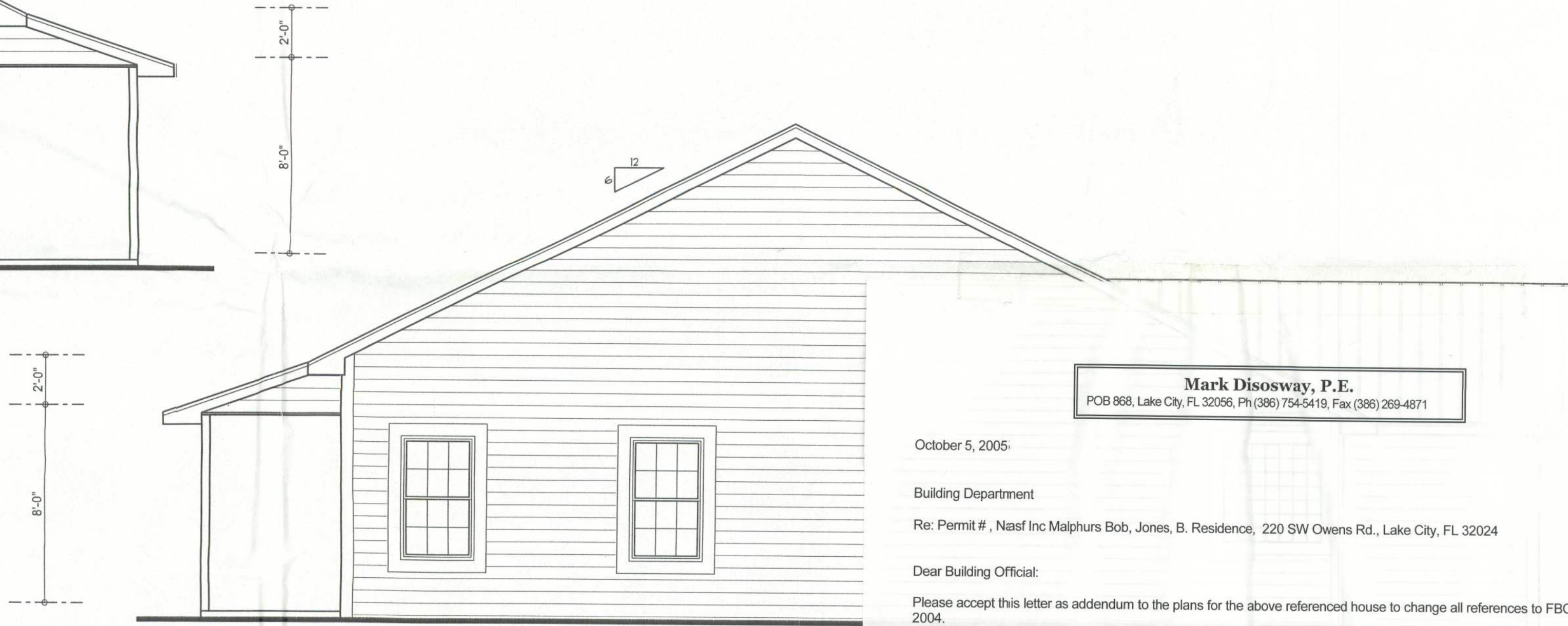
RIGHT ELEVATION SCALE: 1/4" = 1'-0"