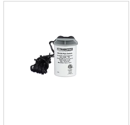
TRADEPRO® TP-CS-2 CONDENSATE SWITCH ELB