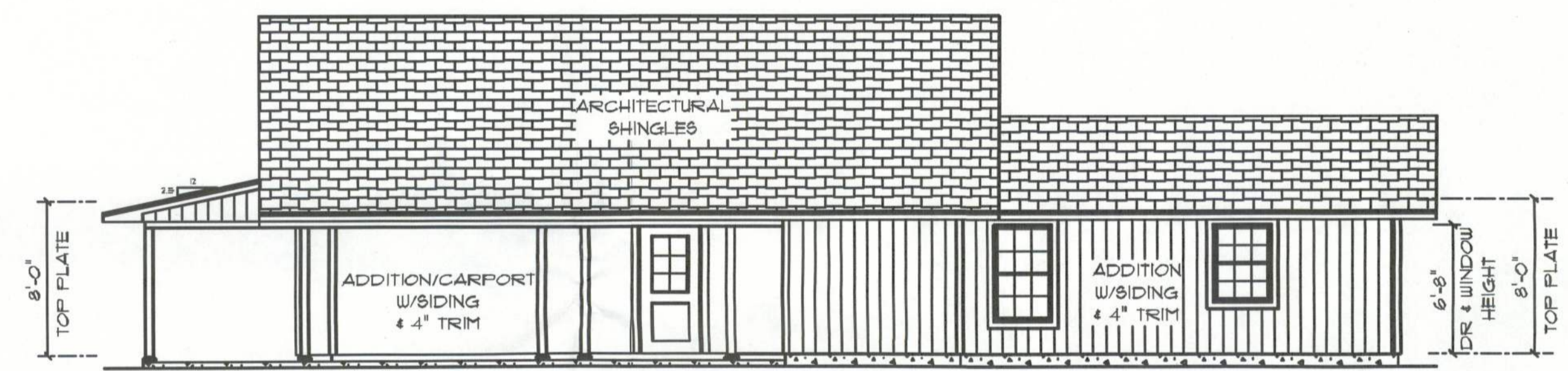
• PROPOSED RIGHT ELEVATION •