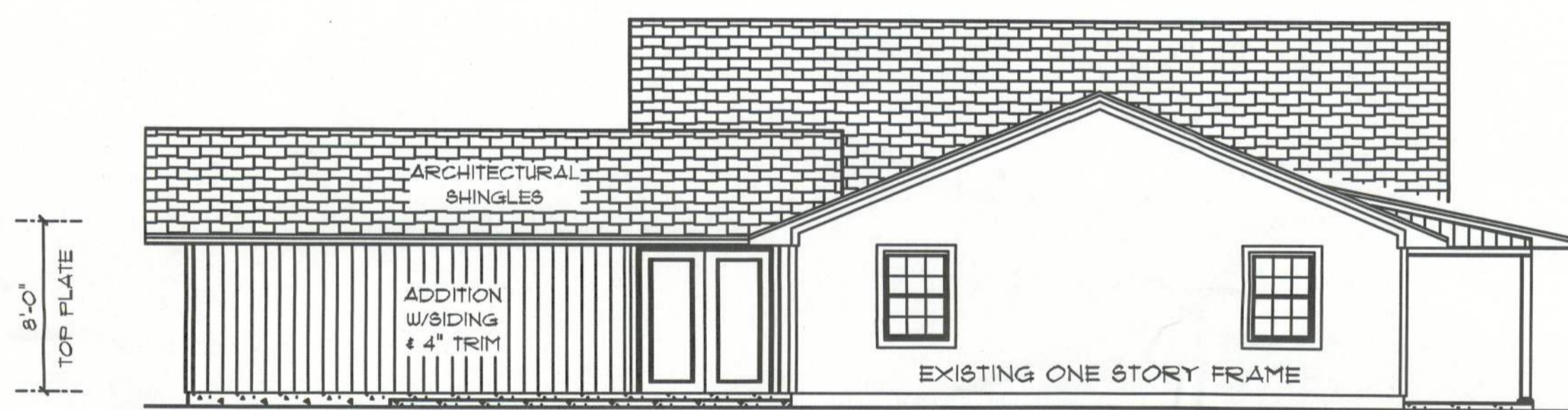
• PROPOSED LEFT ELEVATION •