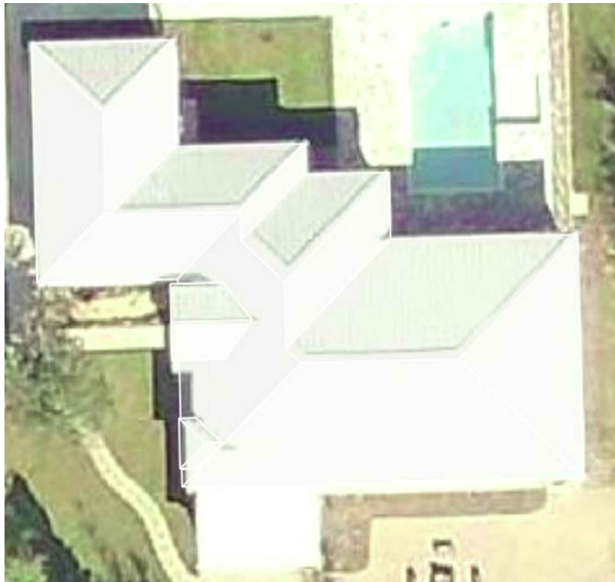
1 PLOT PLAN A-00