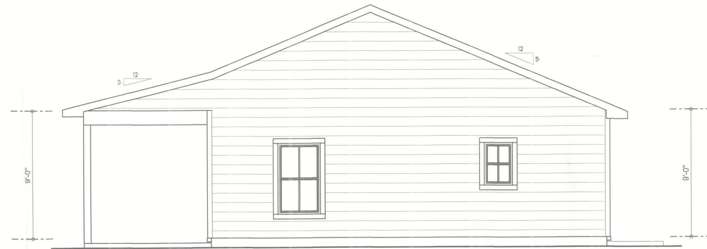
RIGHT ELEVATION SCALE: 1/4" = 1'-0"