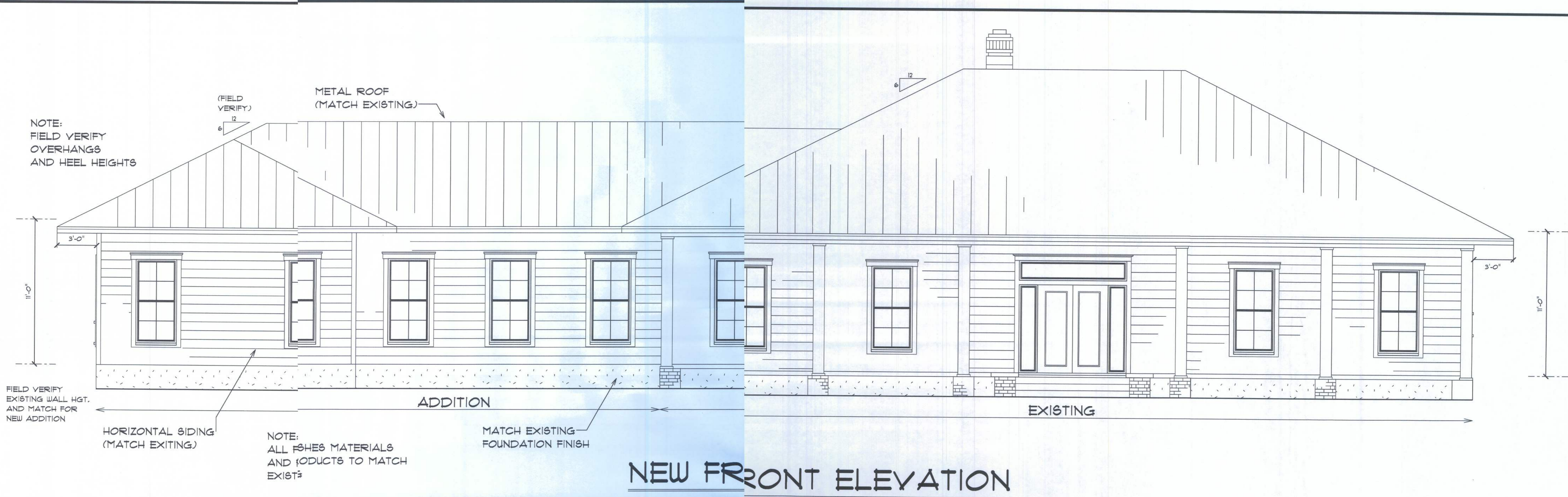
NEW FRONT ELEVATION